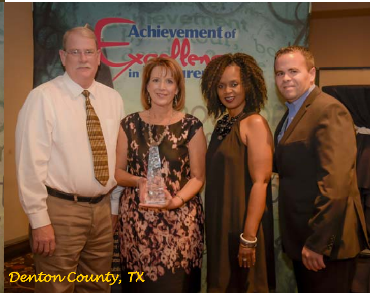
Denton County, TX