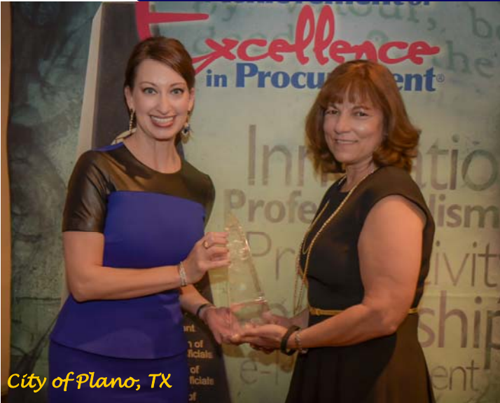
City of Plano, TX