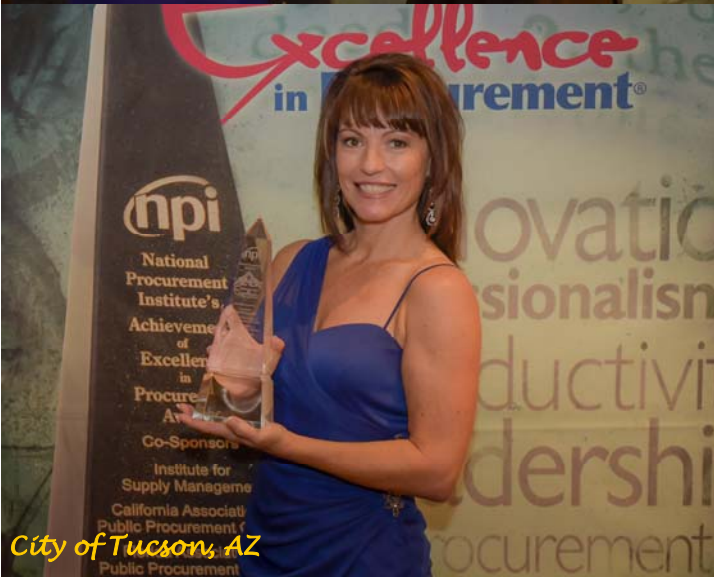
City of Tucson, AZ