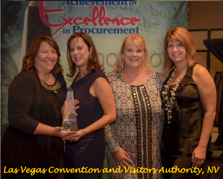
Las Vegas Convention and Visitors Authority, NV