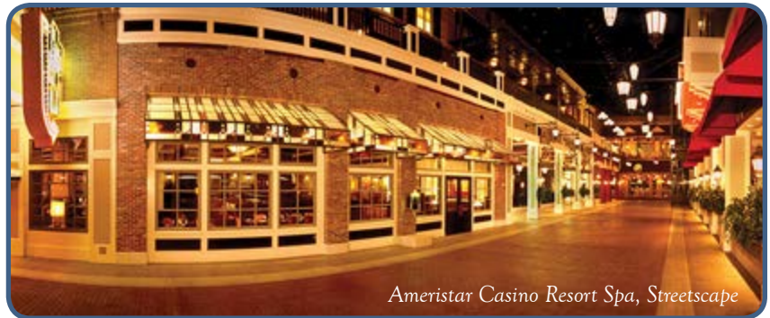
Ameristar Casino Resort Spa, Streetscape